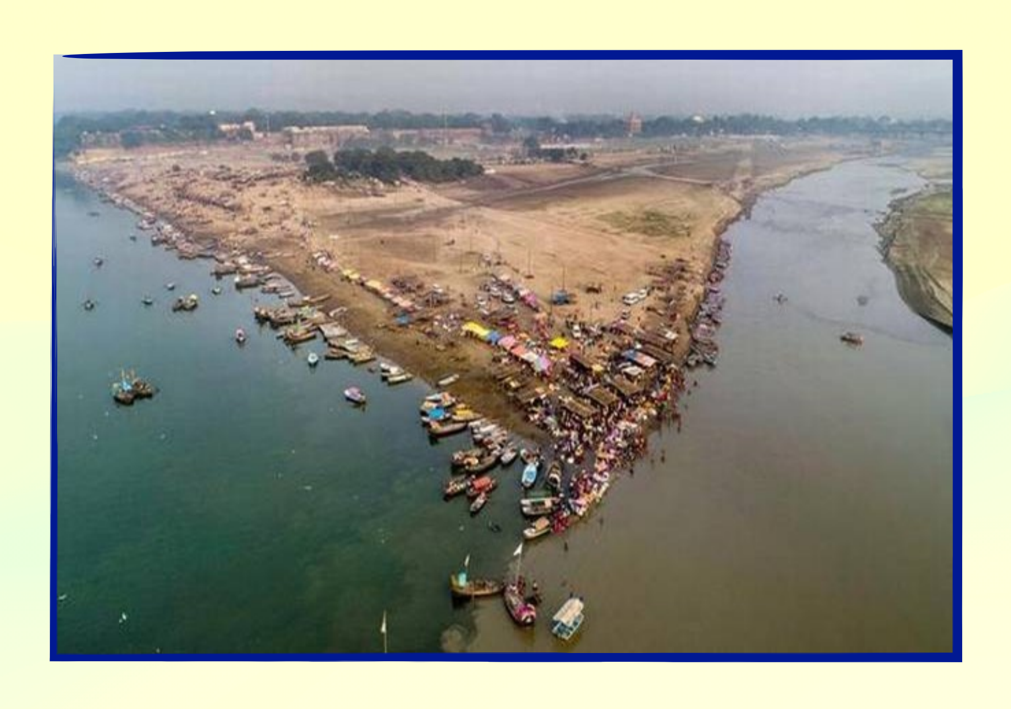
Sangam where Ganga, Yamuna & Sarasawati rivers join!! The king of Prayags!!